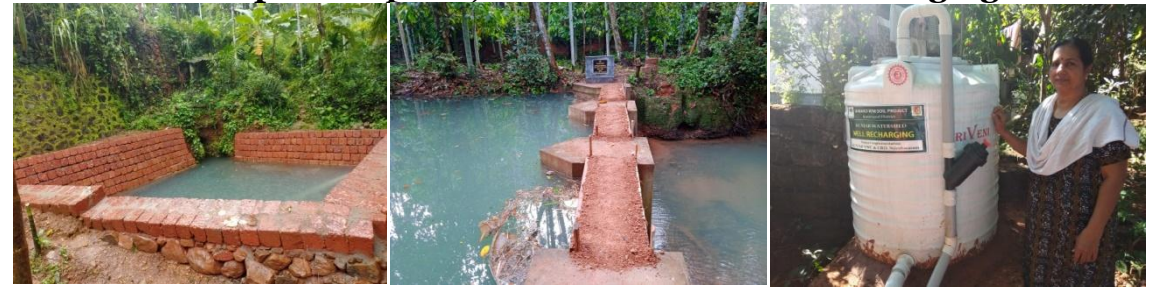
Before after work of Paddy Field Bund